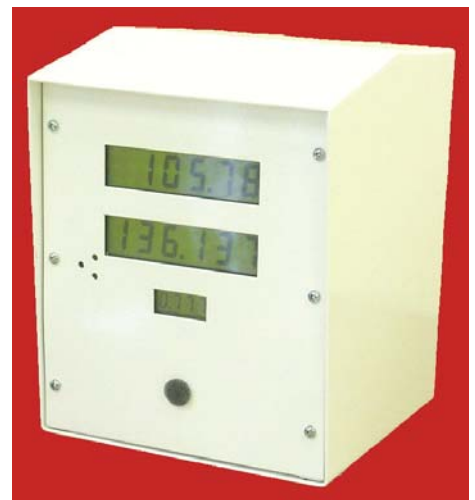
Head Shown in Bulk Meter Mount

The audit features in programming are sealable so any metrological data meets government Weights and Measures requirements.